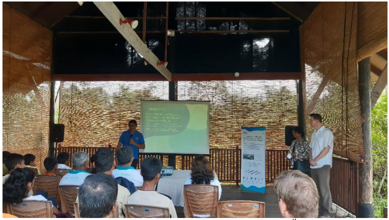
Figure 7: Video screening event at Diyasaru Park – 20<sup>th</sup> January 2024

Table 4: Site Coordinators and/or Community Representatives (F and M) for the five new wetlands