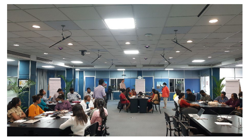
Figure 3: Participants at the community environmental management course workshop – 17<sup>th</sup> February 2023, held at IWMI

The course is freely available to anyone to carry out in their own time and at their own speed but to facilitate learning we held a guided program from October 2022 through to February 2023. Sixty-eight people enrolled for the facilitated course. Individuals were encouraged to engage with a topic each week and we held a weekly online meeting to discuss the topic and share experiences. This culminated in a face-to-face training session at IWMI in Colombo (31 participants, 18 Female, 13 Male) in February 2023 during the visit of the CC team (Figure 3) To date, the online course has been viewed by 7499 people with 469 people completing the course (English course – 445 people, Sinhala course – 9 people and Tamil course 15 people).