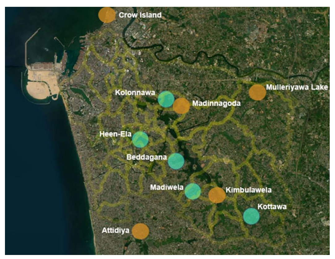
Figure 6: Map showing the location of the 5 original (green) and 5 more recently selected (beige) wetland communities. Legend for the colored dots.